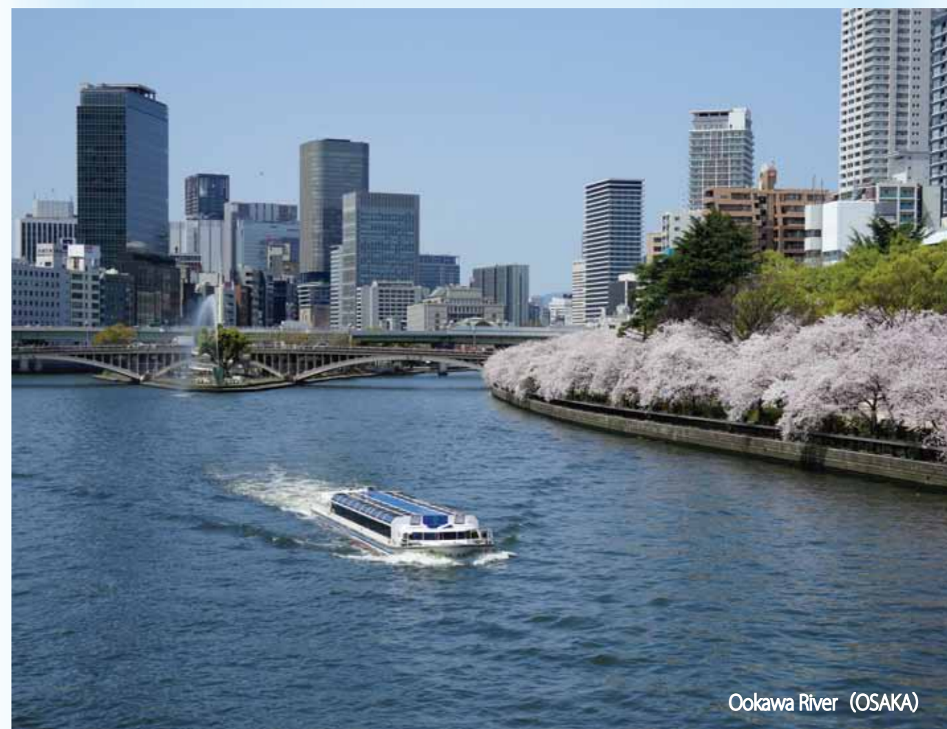
Ookawa River (OSAKA)