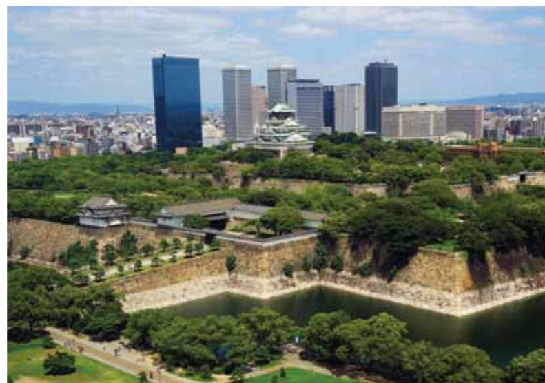
Osaka Castle Park