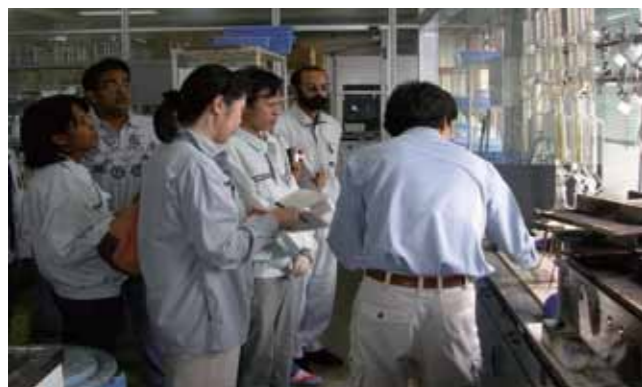
Lecture class for trainee from JICA by EMATEC