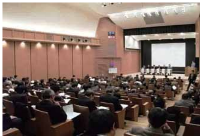
Seminar on waste-water treatment technology for Asian Countries by EMATEC & Ministry of the Environment